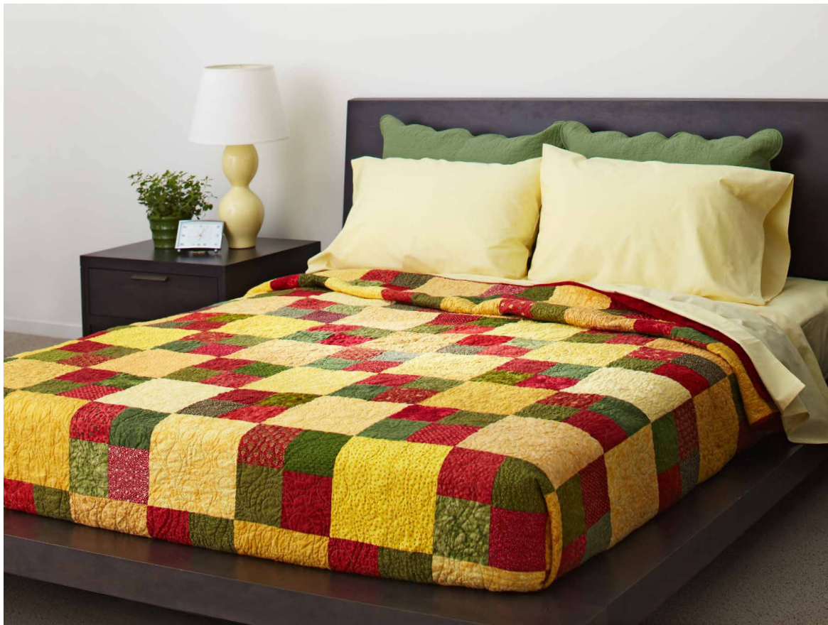
Time-saving strip piecing makes it easy to complete a Four-Patch quilt.