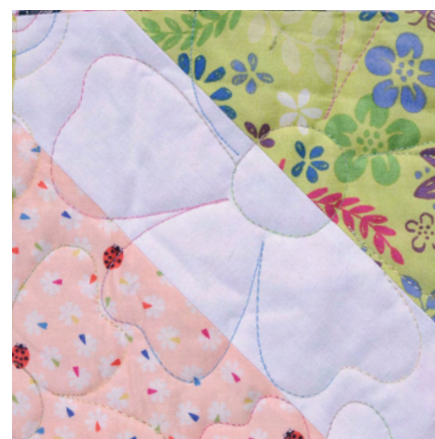
dia. 1. Block