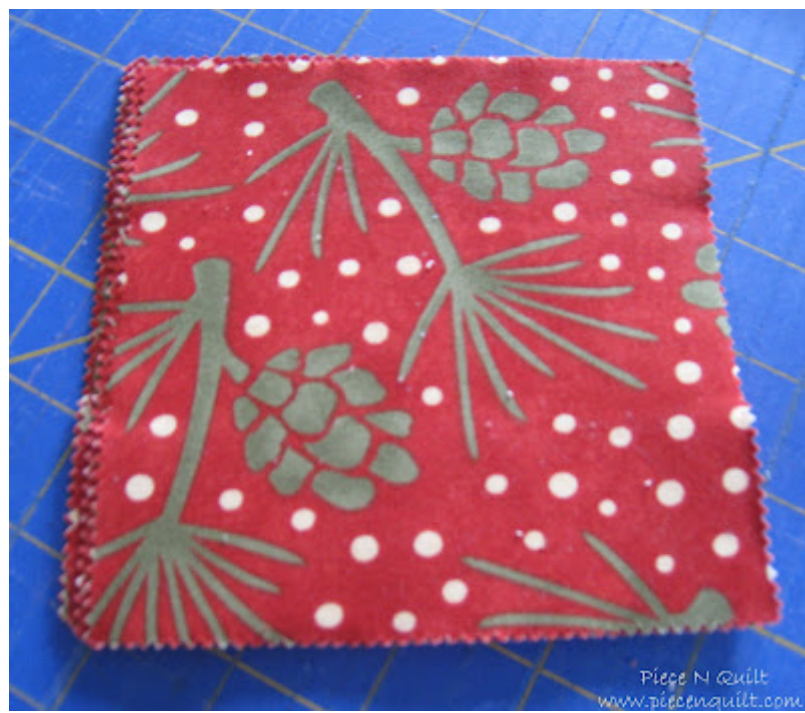
2 Pink Charm Squares