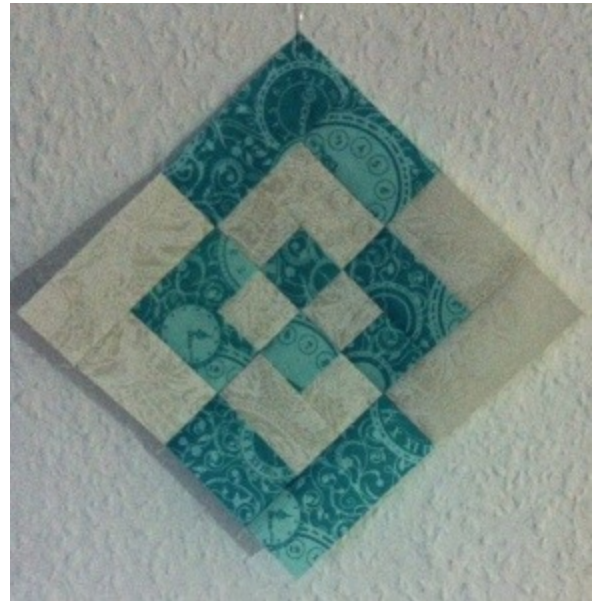
6" x 6" block

Please, refer to the diagram below for the following steps.