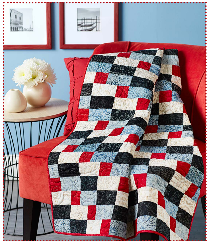
FABRICS are from the Fire & Ice Batik collection for Moda Fabrics ( modafabrics.com ).

Red squares add a punch of color to serene blue and white strips.