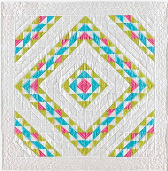
Fabric provided by Moda Fabrics, Sew Stitchy