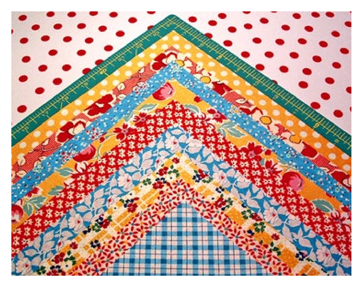
Put one stack on your mat with the edges aligned, and make an angled cut like so: