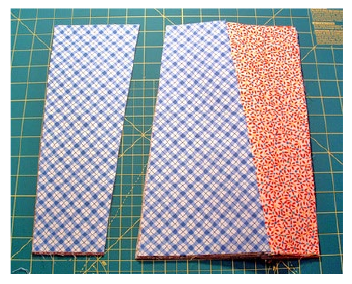
This time take the top TWO pieces from the narrow stack and move them to the bottom: