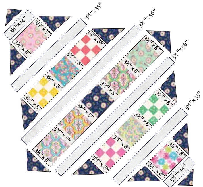
Quilt Assembly Diagram

Refer to the Quilt Assembly Diagram for Center Block, Nine-Patch Block, Sashing, and Setting Triangle placement. Sew rows together on the diagonal to complete the center of the quilt. Add Corner Triangles. The Corner and Setting Triangles are intentionally cut larger in order to square up the quilt center. Square up the quilt center by cutting 2 3/8" beyond the assorted print 7½" Center Block and Nine-Patch Block points on all sides.